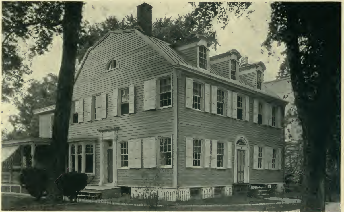
DR. BILDERBECK'S HOUSE, SALEM, NEW JERSEY. Built in 1813

An example of the use of a large central dormer with smaller ones on either side; characteristic of houses of this class in the South